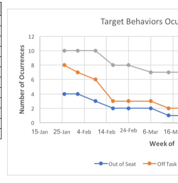
Figure 1. Target Behaviors Occurrences Scattered Graph